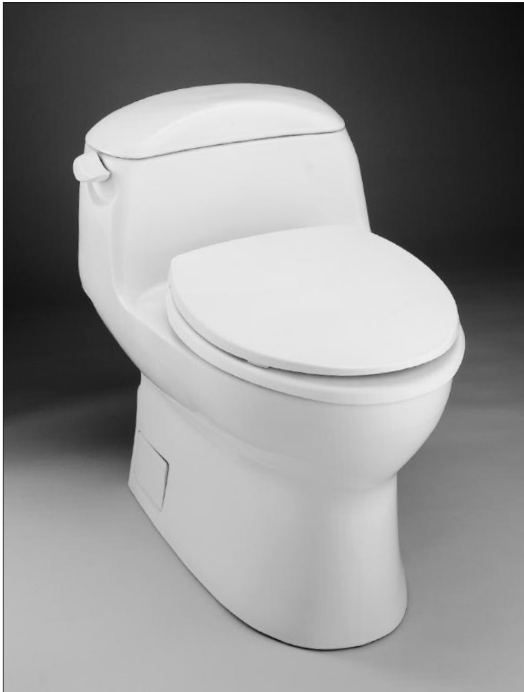
MS914114 - Toilet with SoftClose Seat